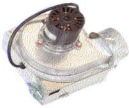
Cress Clean Air System